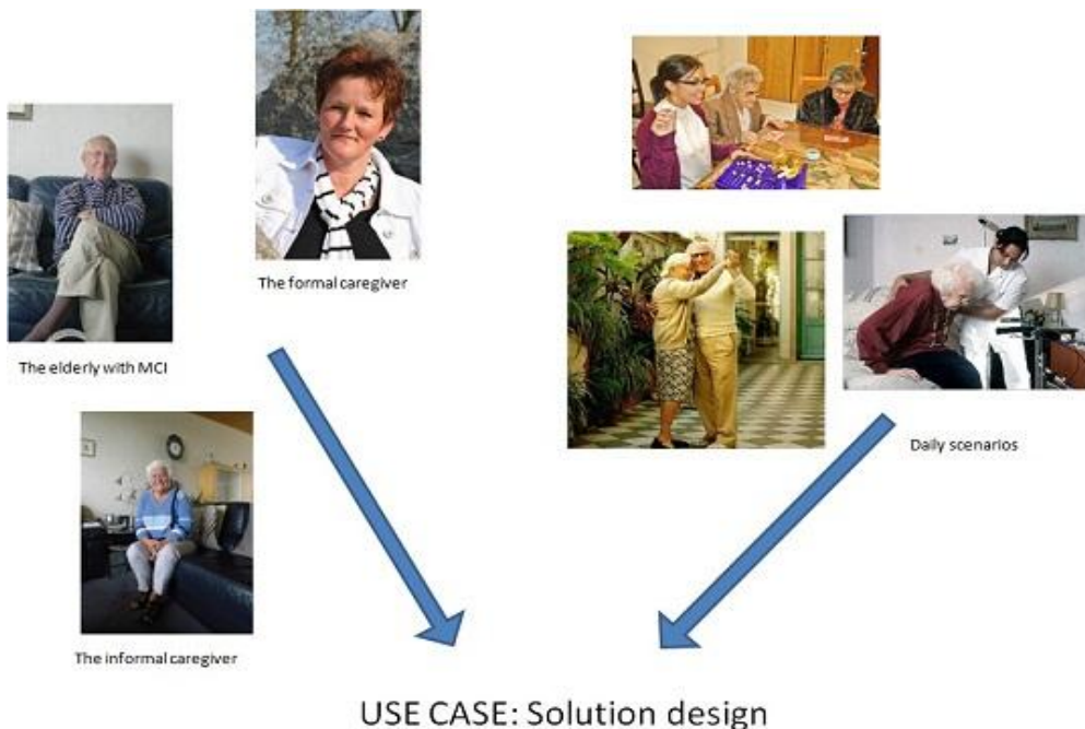
Figure 2.- MyGuardian Use Case creation

Once we have the critical design information, we have added few personal details in order to adapt use cases to the real life. To add this information we have used the interview details too.